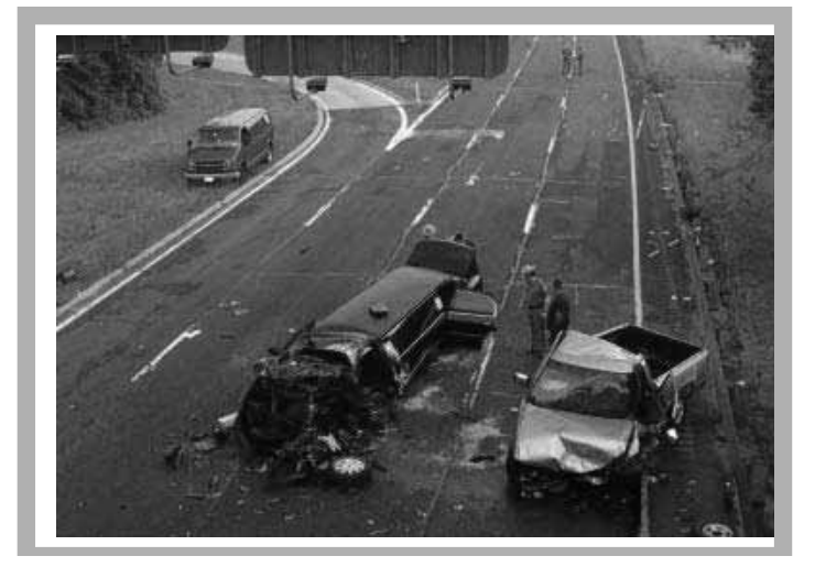
Newsday Long Island