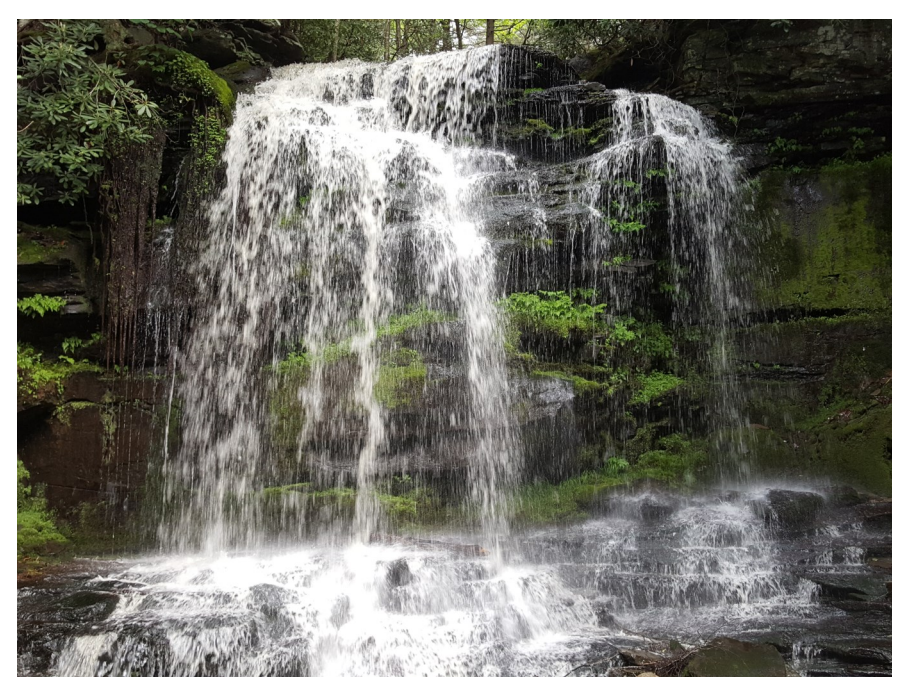
Mullet Falls near Rock Hill was the June destination for the Sullivan County Employee Walk.

County workers, their spouses, friends, the public and even the news media have trekked down local rail trails, up the side of Tusten Mountain, and through green forests to a hidden waterfall. Continued on page 3