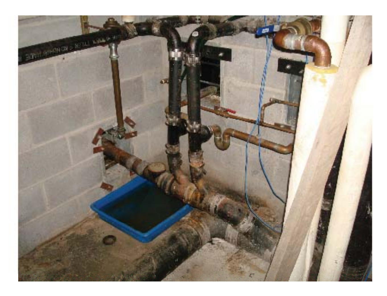
Aged, rusting, and leaking pipes