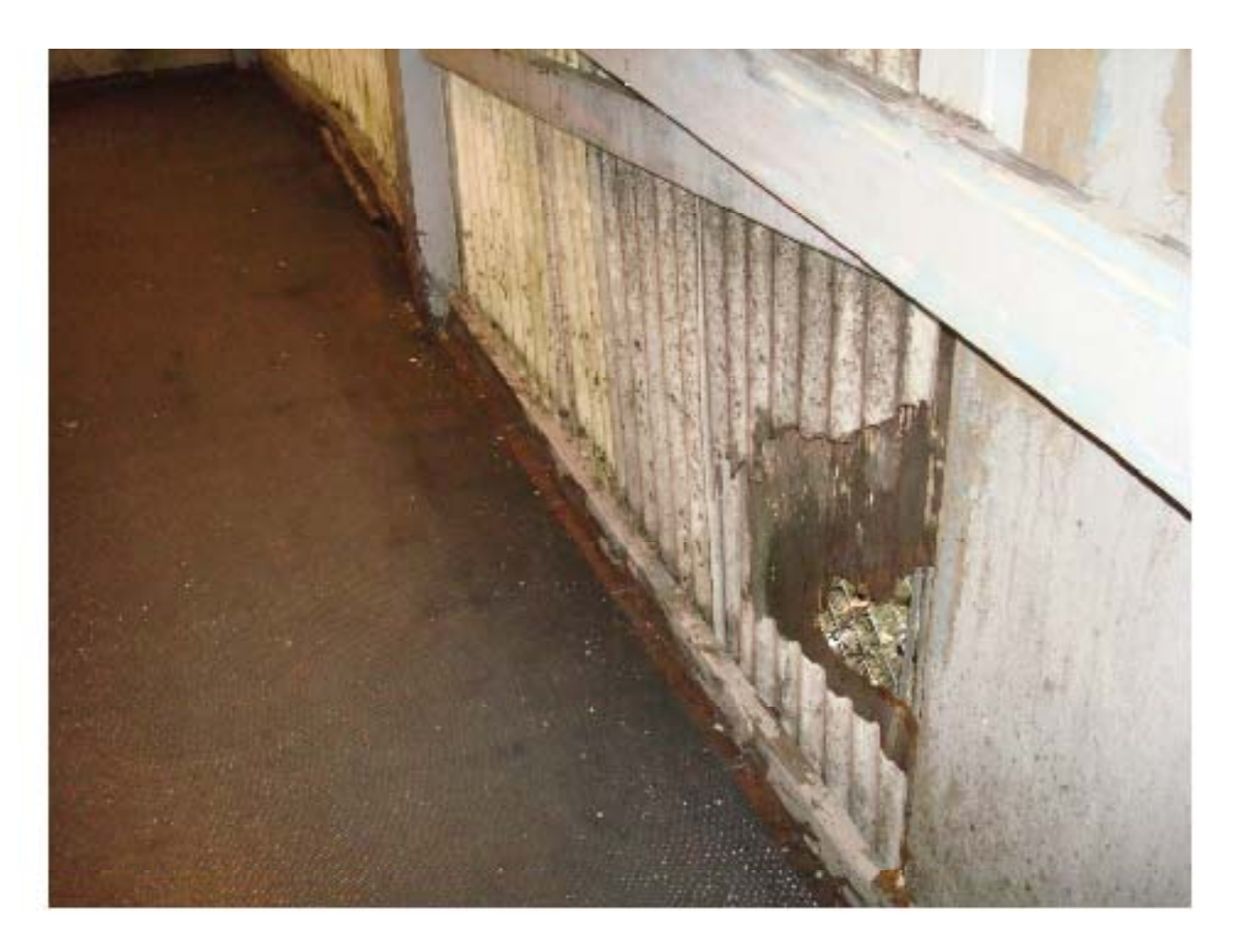
The destruction of this wall was due to water and moisture damage. Wood is nailed across to keep it in place. Notice the hole with wire fencing showing to outside facility.