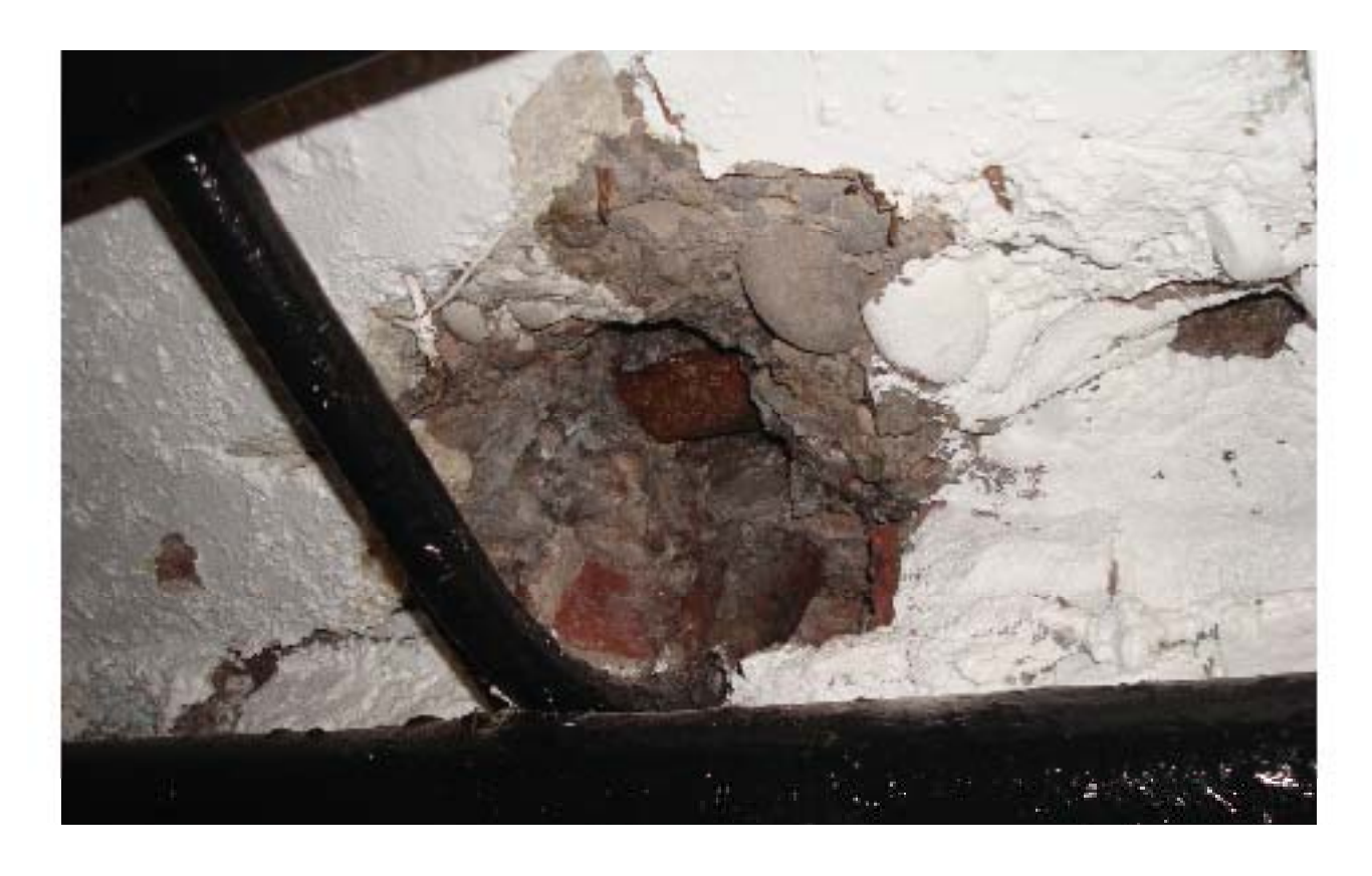
The ceiling is crumbling due to water damage.