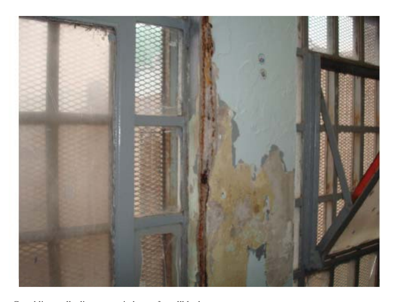
Crumbling wall adjacent to windows of a cellblock.