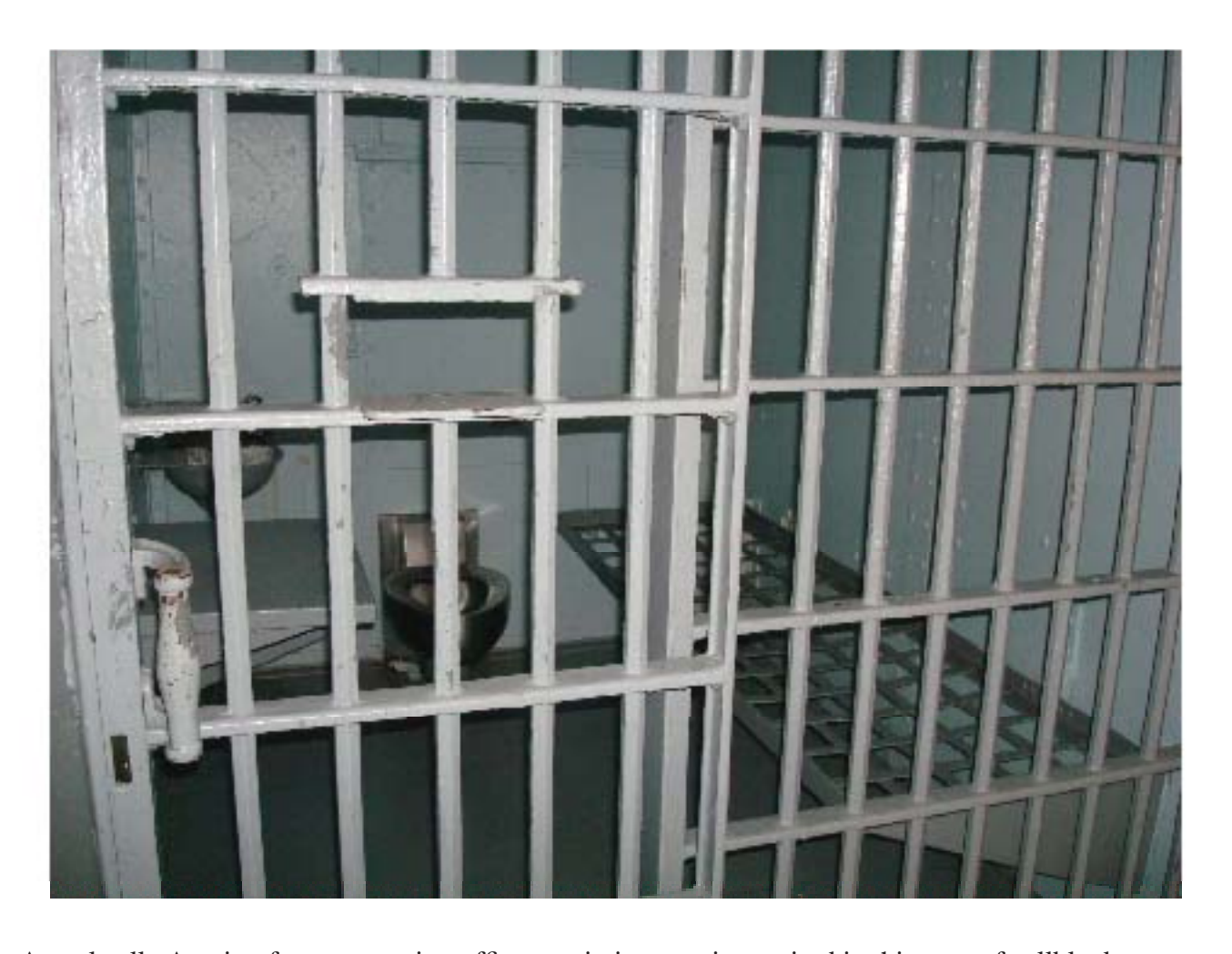
Actual cell. A ratio of one correction officer to six inmates is required in this type of cellblock.