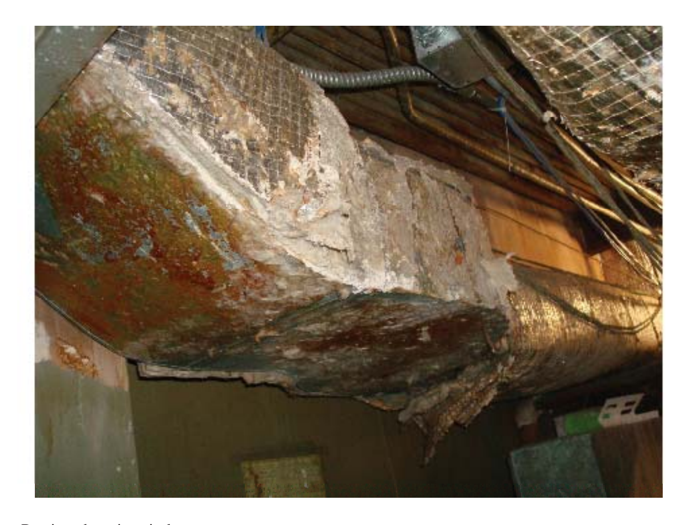
Rusting, decaying air ducts.