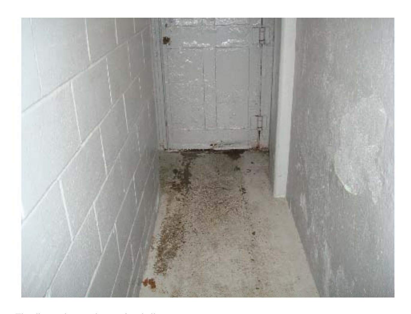
Flooding and water damage in a hallway.