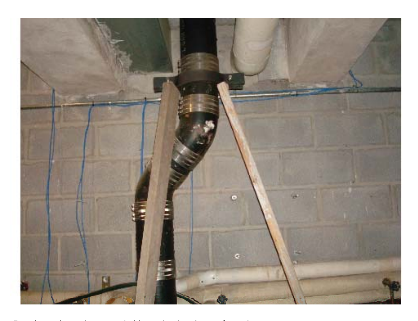
Repairs to these pipes were held together by pieces of wood.